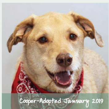
Cooper-Adopted January 2019

Questions? Contact Samantha at (517) 626-6060 ext. 125 or Shegeman@AdoptLansing.org .