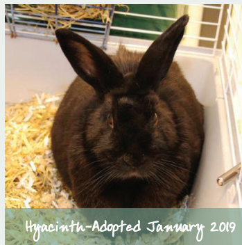
Hyacinth-Adopted January 2019