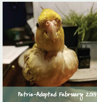
Petrie-Adopted February 2019