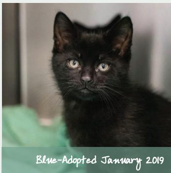
Blue-Adopted January 2019